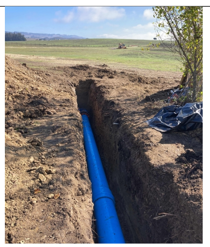
New 12-Inch water main