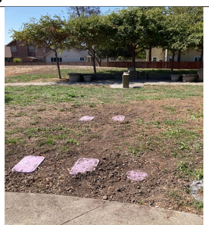
Recycled water converter boxes